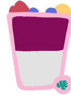
CH-CH-CH-CHIA AÇAÍ WITH CHIA PUDDING, FRESH FRUITS, GRANOLA, NUTS & SUPERFOODS