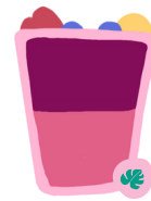
BERRIED ALIVE AÇAÍ WITH STRAWBERRY COCONUT SORBET, FRESH FRUITS, GRANOLA, NUTS & SUPERFOODS