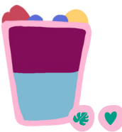
LOVE ME LYCHEE AÇAÍ WITH BLUE PEA LYCHEE SORBET, FRESH FRUITS, GRANOLA, NUTS & SUPERFOODS