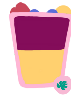
GOLDEN HOUR AÇAÍ WITH ACEROLA PINEAPPLE SORBET, FRESH FRUITS, GRANOLA, NUTS & SUPERFOODS