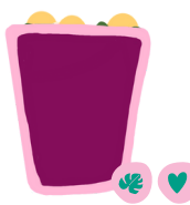
NUTTY PARTY AÇAÍ WITH BANANA, GRANOLA, NUTS & CACAO NIBS