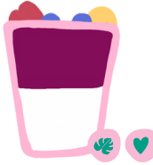
COCO GLOW AÇAÍ WITH COCONUT SORBET, FRESH FRUITS, GRANOLA, NUTS & SUPERFOODS