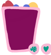
TRIPLE A AÇAÍ WITH FRESH FRUITS, GRANOLA, NUTS & SUPERFOODS