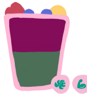
LEAN & GREEN AÇAÍ WITH PASSIONFRUIT MANGO SPIRULINA, FRESH FRUITS, GRANOLA, NUTS & SUPERFOODS