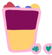
MANGO TANGO AÇAÍ WITH MANGO SORBET, FRESH FRUITS, GRANOLA, NUTS & SUPERFOODS