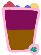
DRIVIN' ME NUTS AÇAÍ WITH CHOCOLATE PEANUT BUTTER BANANA SORBET, FRESH FRUITS, GRANOLA, NUTS & SUPERFOODS